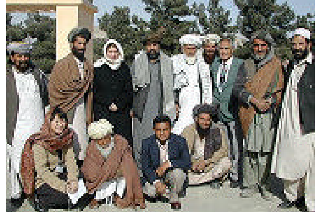
Kutchi tribal leaders

Apart from such training, special efforts must be made to address such fundamental issues as the institution's bilingualism (it will operate in Dari and Pashto), the full participation of women in parliament after nearly 10 years of Taliban rule, relations between the Assembly and the public, including vulnerable groups such as the Kutchi nomads, and the roles of political groups and parties in the Assembly. The numerous meetings that the mission held with civil society representatives and political figures made it clear that everyone expects the new National Assembly to be open, transparent and representative of all Afghan citizens, whatever their ethnicity. It must act as the interface between the State and the people, at the same time playing a key role in an extensive civic education programme to enhance public outreach.