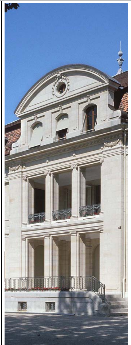
A reserve is established for repairs to the House of Parliaments when they are needed.

By contract, the IPU has to assure the payment of the pensions of eleven former employees of the Secretariat. The closed pension fund has a reserve of about CHF 10 million which is invested in a mixed portfolio of bonds and equities. By 2012, the full amount of the decline in equity values over 2007-09 will have been reflected in the asset value of the fund for actuarial purposes and any future increase in interest rates will reduce the actuarial liability. If equity and bond markets remain stable, then the closed pension fund should be sustainable without further contributions from the IPU.