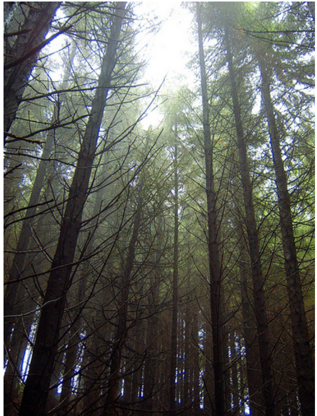
The IPU uses paper from sustainable sources

The establishment of a Finance subcommittee of the Executive Committee will require additional support and documentation from the division.