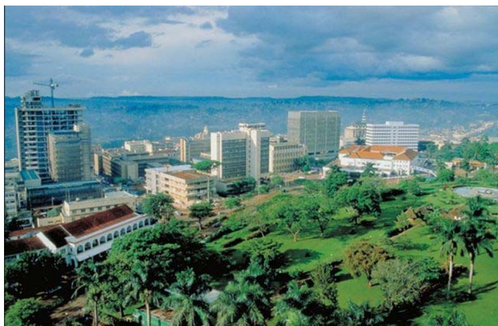
City view of Kampala, Uganda, venue of the 126 th Assembly

Starting in 2008, the Division tracks the indirect greenhouse gas emissions that result from international staff travel and reports these annually to the Governing Council.