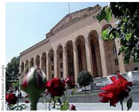
The Parliament of Georgia.

annul major treaties that the government signs with other countries and grant pardons. The revised Constitution also provides that the country shall respect and protect the human rights of its citizens.