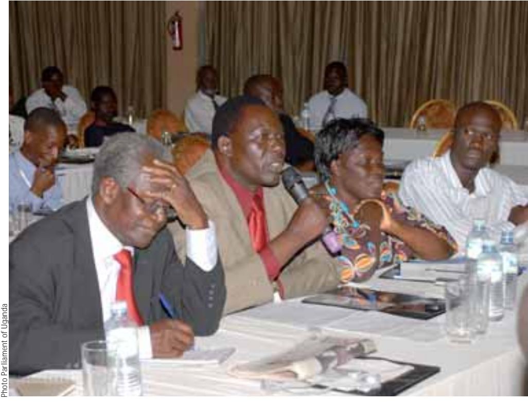
IPU seminar on reconciliation in Uganda.

All of these recommendations have been incorporated into plans of action, some of which are already being implemented, while others will be shortly. The IPU provides direct assistance in implementing several of these recommendations. AA