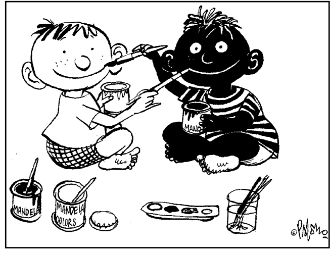
Drawing by Pepe Palomo.

The image is still in our minds...it was February 1990. Television screens across the world were going to show the first pictures of the man who was considered to be the oldest political prisoner in the world. Finally he came out - a willowy figure with a radiant smile - and walked straight to his freedom, regained after