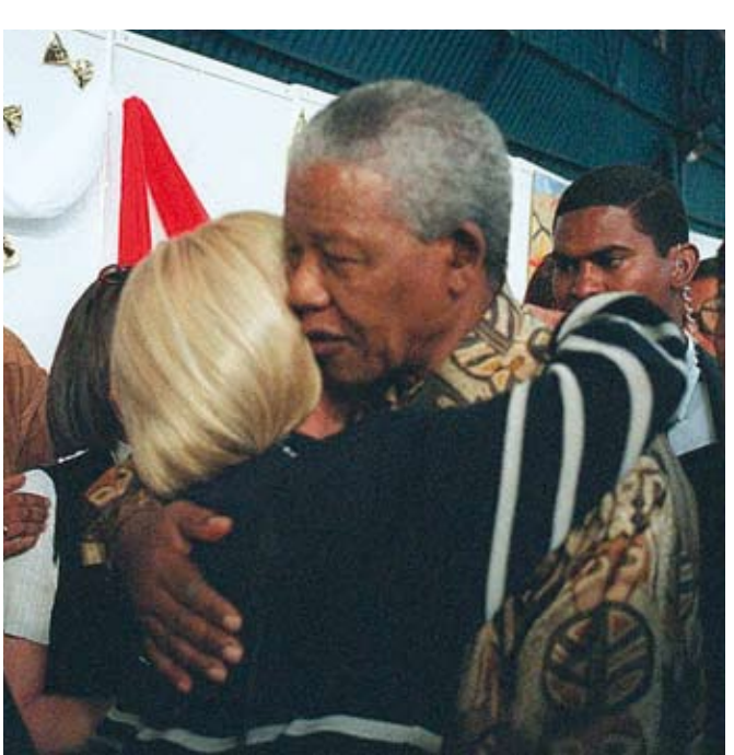
Former President and 1993 Nobel Peace Prize Laureate Nelson Mandela: the key person of the reconciliation in South Africa.

IPU President in the Middle East 6 Latest statistics of Women in Politics 8 Parliaments tackle poverty in LDCs 12