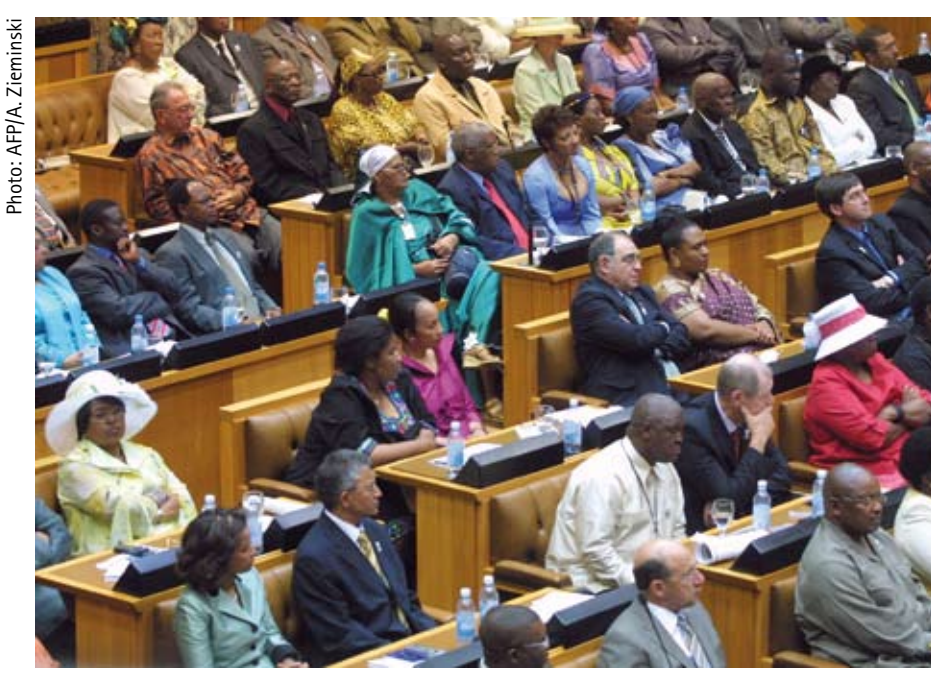
South African Parliament in session.