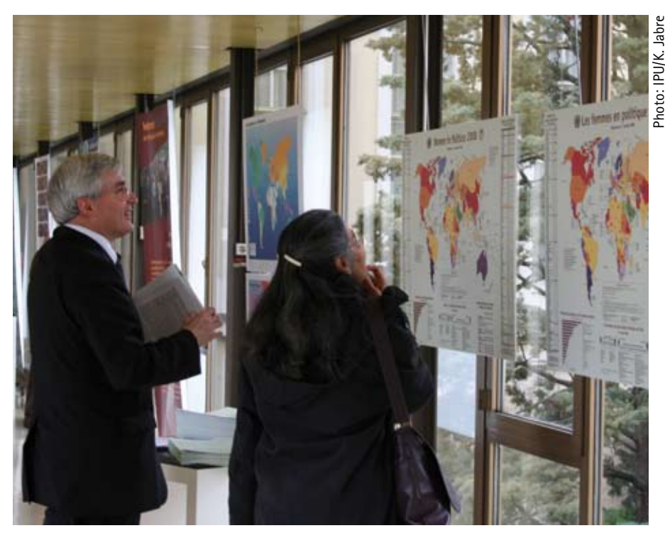
IPU-UN Map of Women in Politics 2008.

Women remain a minority in the highest positions of the State. Of the 150 Heads of State at the start of 2008, only seven or 4.7 per cent were women. For heads of government, the proportion is lower still, at 4.2 per cent, accounting for eight women among the world's 192 heads of government. For women Speakers of Parliament, the total stands at roughly 10 per cent – 28 women Speakers of Parliament, almost half of which come from Latin American and Caribbean parliaments.