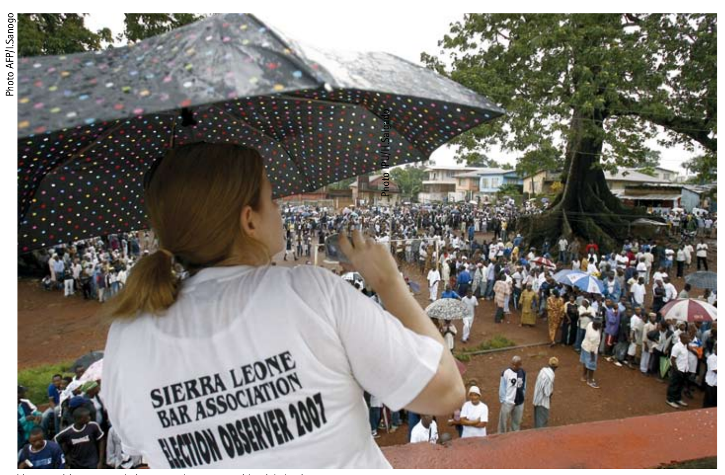
Voters waiting to cast their vote at the 2007 presidential election.

The Parliament is among a number of post-conflict African parliaments the IPU has identified as beneficiaries of a two-year project intended to build capacity to establish, monitor, assess and provide follow-up on the work of transitional justice mechanisms, such as truth and reconciliation commissions, and to strengthen inclusive political processes. The Parliament will host a regional seminar on those topics in June 2008. In addition, the IPU, in cooperation with other partners, including the United Nations, is designing a far-reaching programme of assistance for the Parliament.