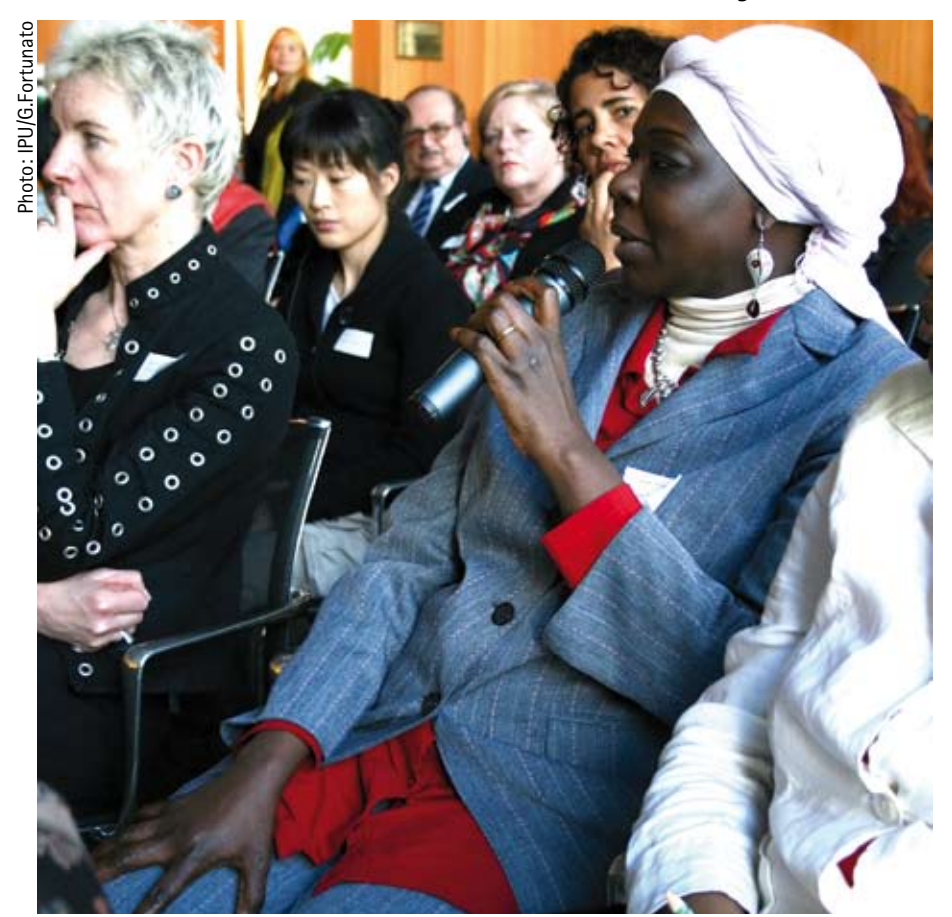
The IPU called for synergy among international organizations, political and religious leaders, the media, civil society and the medical corps.

Representatives of IOM, WHO, OHCHR, the UN Committee on the Rights of the Child, the Inter-African Committee, the Department of Institutions of Geneva, UNICEF Switzerland as well as representatives of civil society were in attendance to this panel, moderated by Euronews journalist Mohamed Abdel Azim.