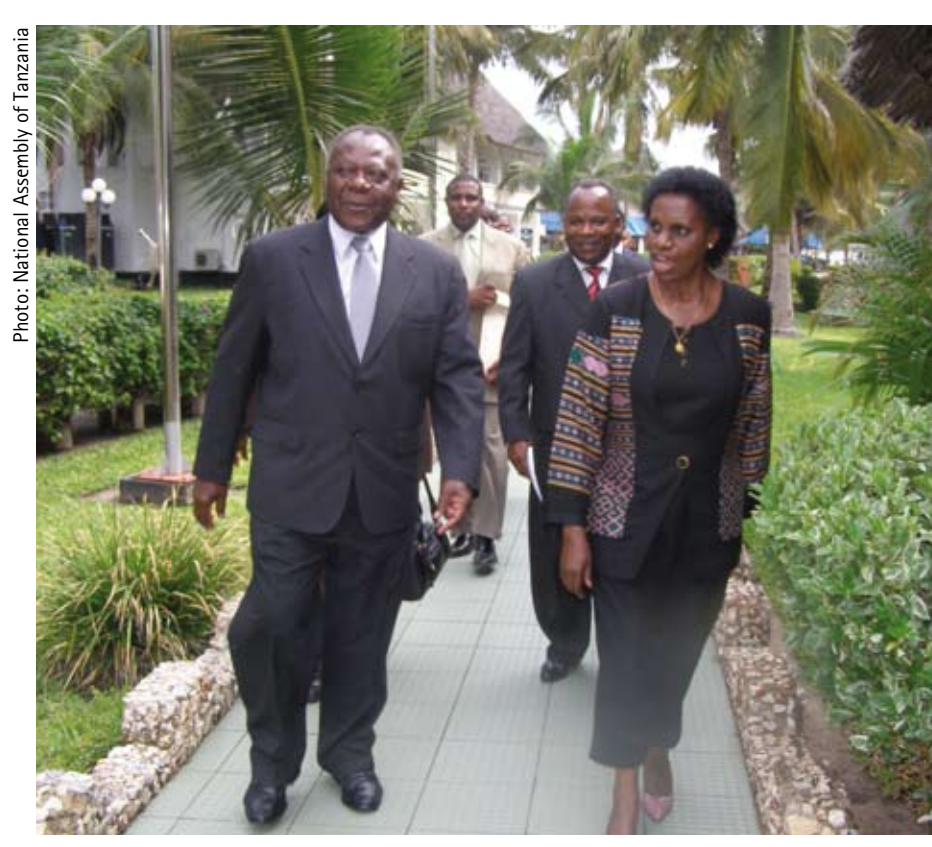
Mr. Samuel J. Sitta, Speaker of the National Assembly of the United Republic of Tanzania and Ms. Anne Makinda, Deputy Speaker.

As a follow-up to the meeting the IPU and the UN-OHRLLS are implementing a project that will ultimately stimulate more active involvement of all 50 LDC parliaments in the implementation of the BPOA. Capacity building for parliaments to establish, monitor, assess, and provide follow-up to this instrument is a key component of that project.