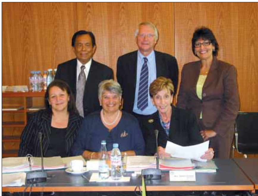
Sitting: from left to right: Senator Alima Boumediene-Thiery (France), Senator Sharon Carstairs (Canada), Senator Rosario Green (Mexico); standing: Senator Aquilino Pimentel (Philippines), Senator Philippe Mahoux (Belgium) and Senator Zahia Benarous (Algeria).

Senator Carstairs proposes that when the Committee presents its report to the Governing Council at IPU Assemblies, the Committee’s five members should briefly provide information on the cases and show pictures, “so that the cases become living human beings to the Assembly delegates. Showing pictures on the