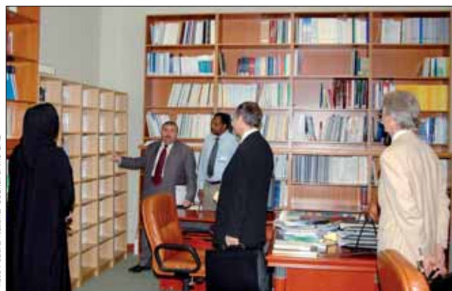
Library of the Federal National Council of the United Arab Emirates

In June 2007, the IPU organized a retreat in Gitega, Burundi, for the key actors of Burundi's parliament. Participants included the leadership of both houses, committee chairs and representatives of women MPs. All the political parties represented in the country's parliament were present at this retreat. Serving as resource persons for the event were MPs from Benin and Burkina Faso. Participants discussed and identified relevant practices and mechanisms to best promote inclusiveness in the functioning of parliament and become a key player in national reconciliation (see also page 4).