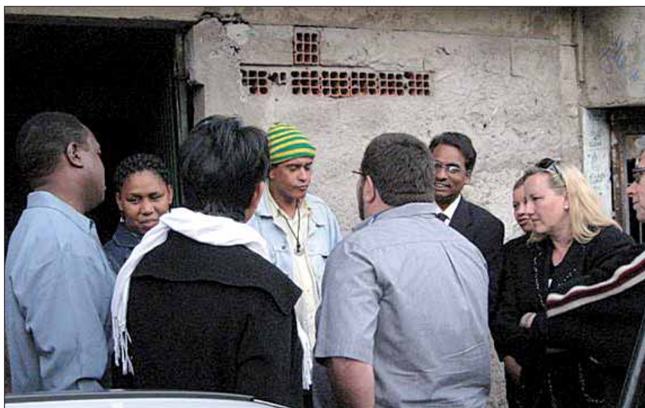
The Advisory Group in a poor district of Sao Paulo.

The IPU Advisory Group on HIV/AIDS was set up in 2006 in order to enlist the full force of the world's legislatures in the fight against the AIDS pandemic, in which parliaments are crucial stakeholders. Keen to expand the scope of its work to parliaments worldwide, the Group will be organizing the first Global Parliamentary Meeting on HIV/AIDS, to be held in Manila, Philippines, from 28 to 30 November 2007. Although there have been a number of national and regional parliamentary initiatives in this area, never before have the world's parliaments been convened to jointly discuss the part they have to play in responding to the crisis. The aim of the meeting is thus to bring the work on HIV/AIDS across to the full IPU membership and engage the entire parliamentary community.