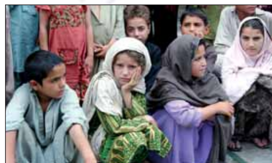
Pakistan: legislators addressed the question of child protection and juvenile justice